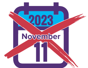
Appendix K will end

OPWDD added the temporary rules from the Appendix K to the permanent waiver agreement.